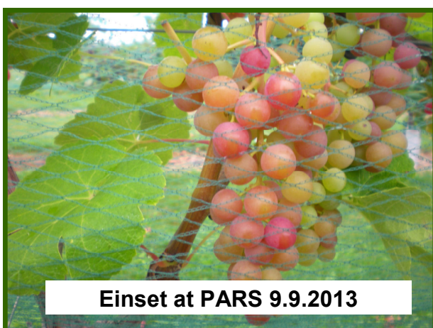
Einset at PARS 9.9.2013