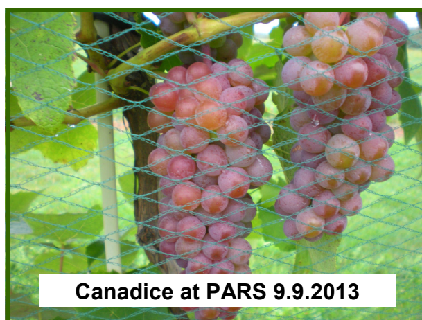
Canadice at PARS 9.9.2013