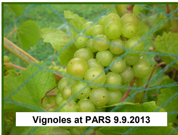
Vignoles at PARS 9.9.2013