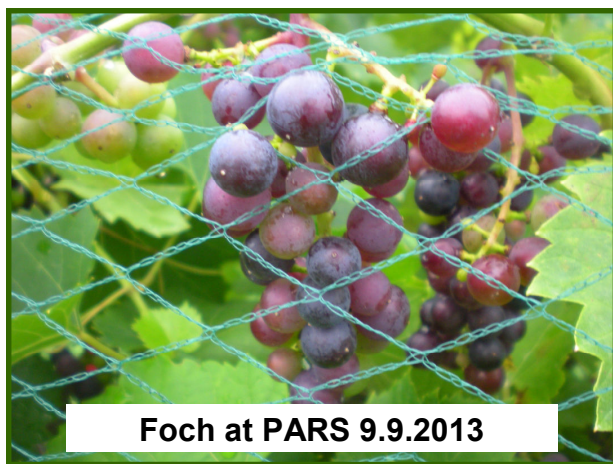
Foch at PARS 9.9.2013