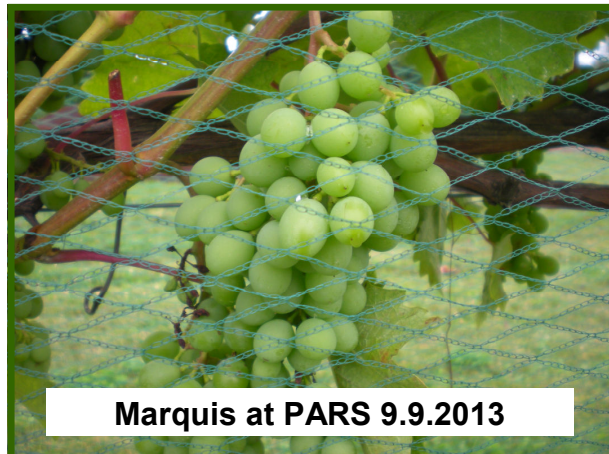
Marquis at PARS 9.9.2013