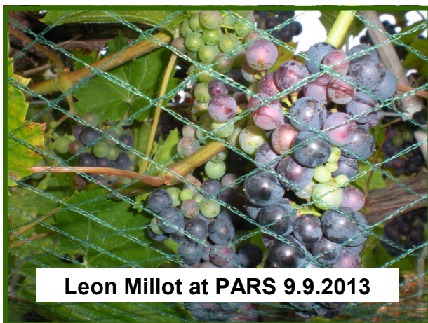
Leon Millot at PARS 9.9.2013