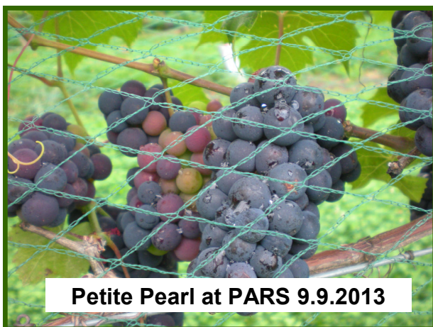
Petite Pearl at PARS 9.9.2013