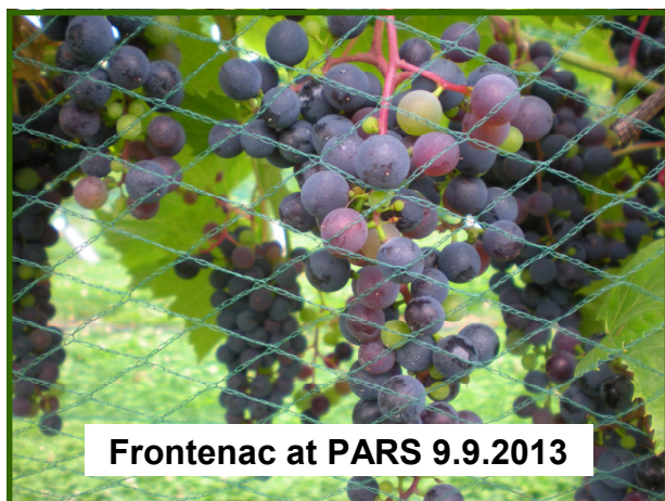
Frontenac at PARS 9.9.2013