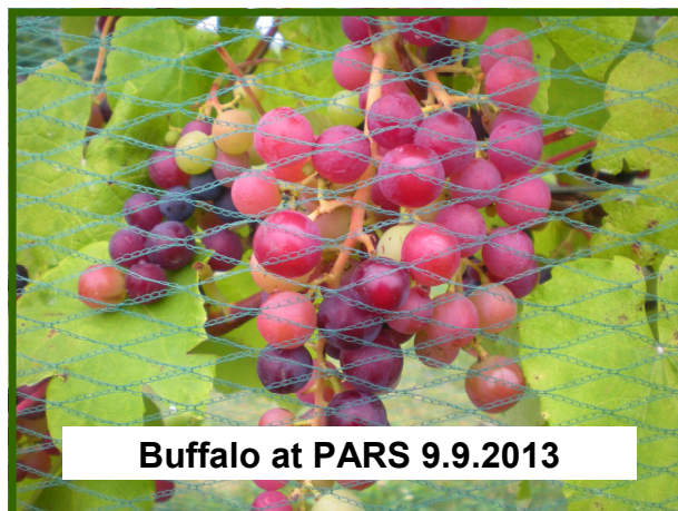
Buffalo at PARS 9.9.2013