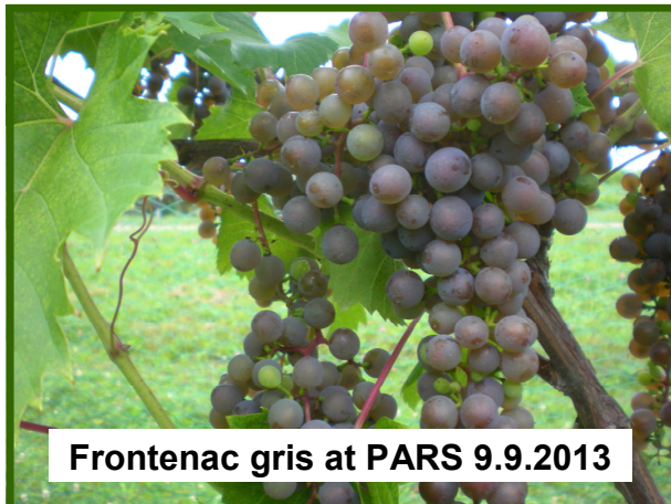
Frontenac gris at PARS 9.9.2013