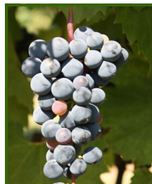
Frontenac at WMARS 9.10.2013