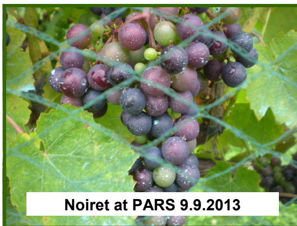
Noiret at PARS 9.9.2013