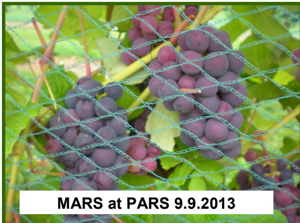
MARS at PARS 9.9.2013