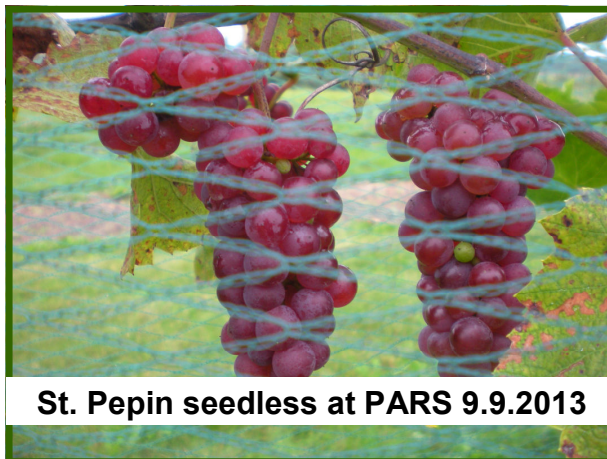
TABLE GRAPE TRIAL