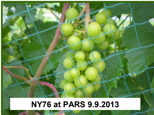
NY76 at PARS 9.9.2013